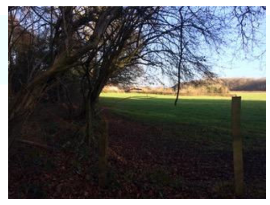
Page 2 of 3.